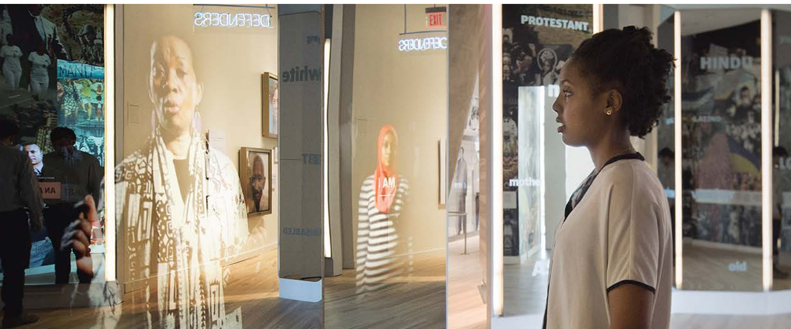
Who, Like Me, Is Threatened? Design: Second Story, part of SapientRazorfish

Winners in the seven categories are considered together for the Best in Show award. The prestigious Best in Show winners get 100% more clicks on the SEGD website.