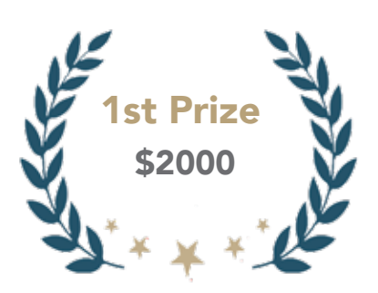
Volume Zero Trophy Certificate of achievement