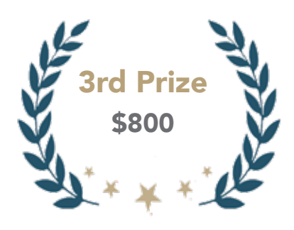
Volume Zero Trophy Certificate of achievement