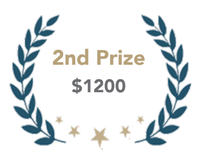
Volume Zero Trophy Certificate of achievement