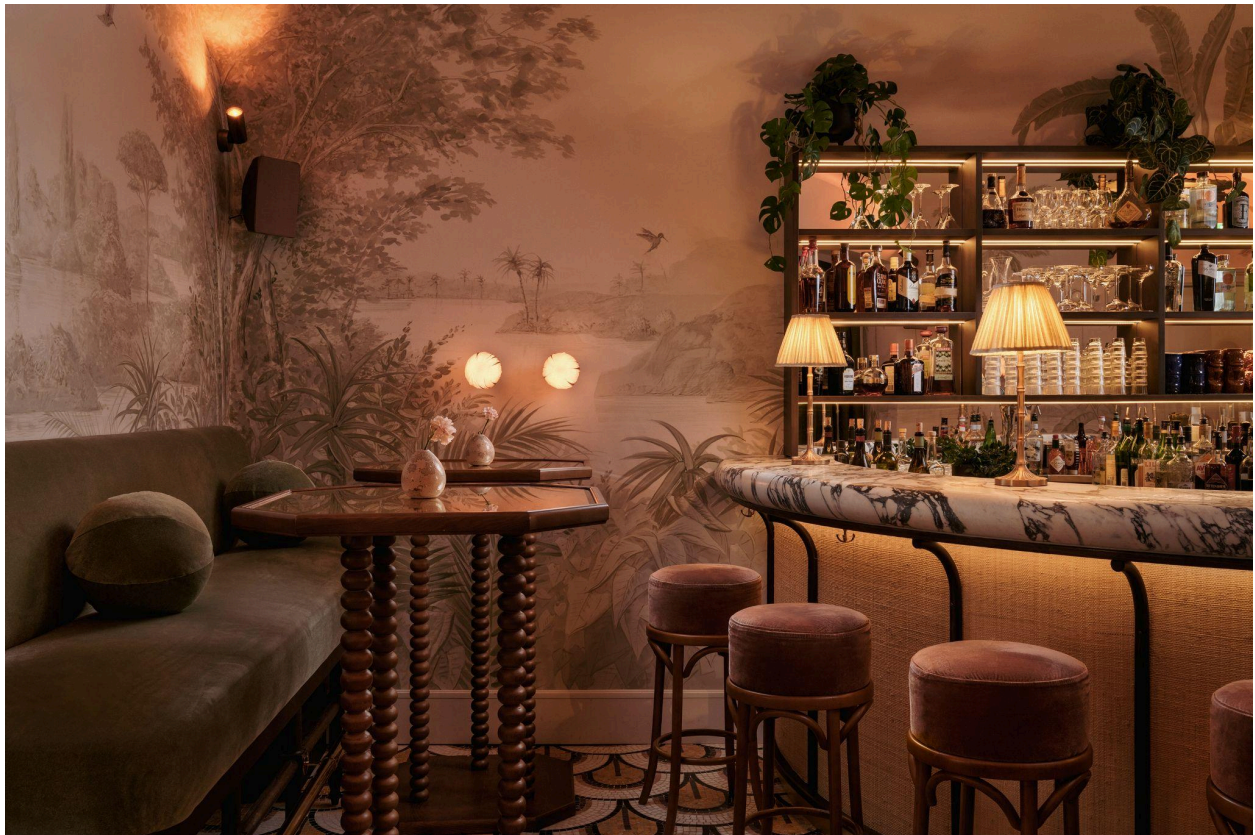
Commercial Interior Design of the Year 2023: Am Hof 8 by T.O. Interior Design

For submission guidelines, and more information about the INT Interior Design Awards, visit their official website .