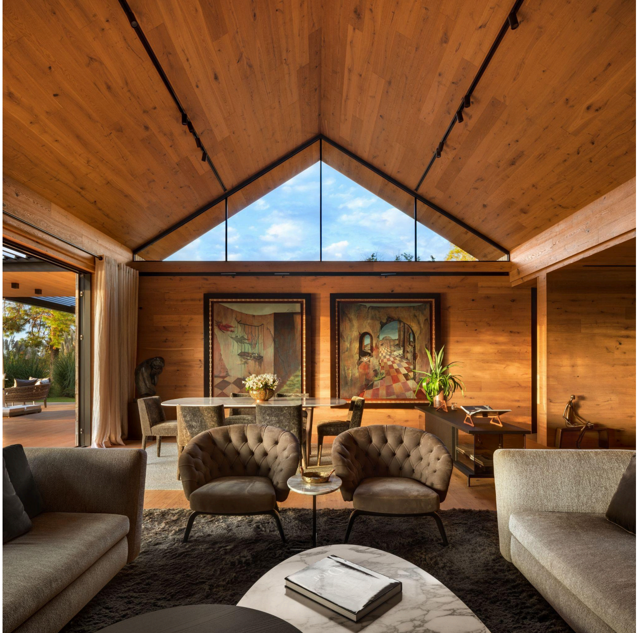
Residential Interior Design of the Year 2023: La Casa de la Abuela by Chain + Siman