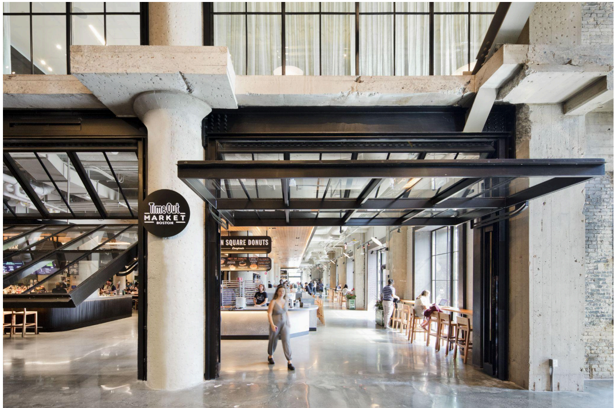
Public Interior Design of the Year 2023: Park Repositioning by Elkus Manfredi Architects

The INT Awards have quickly become a highly sought-after honor for design studios seeking global recognition, client attraction, and elevation of their brand's status.