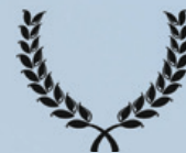
Best in Region West and South Asia Bachelors, Masters, Most Voted