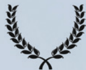
Best in Region Oceania Bachelors, Masters, Most Voted