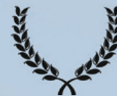
Best in Region Europe and Russia Bachelors, Masters, Most Voted