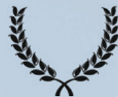
Best in Region North and Central America Bachelors, Masters, Most Voted