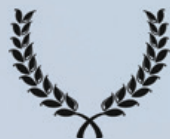
Best in Region South America and Caribbean Bachelors, Masters, Most Voted