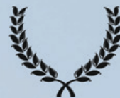
Best in Region Africa and Mediterranean Bachelors, Masters, Most Voted